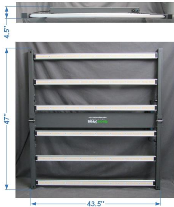
FIG. 1 LUMINAIRE